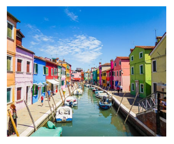
Murano & Burano