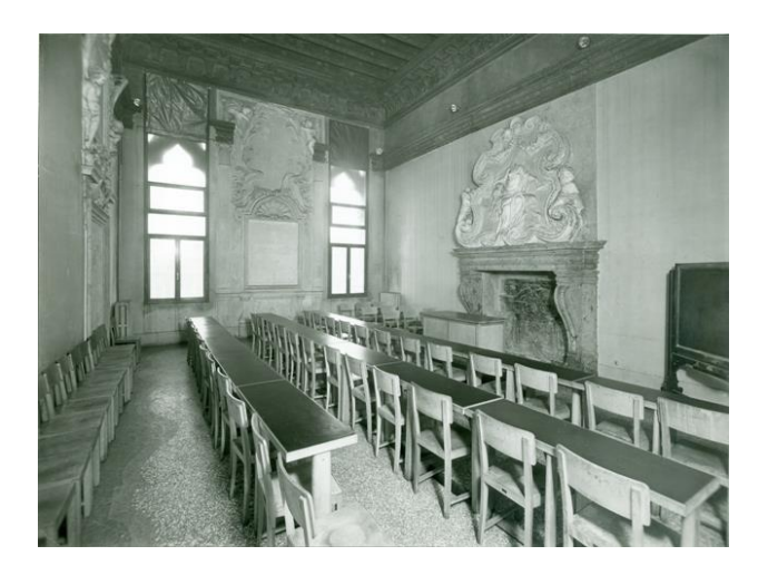
7.Lecture Room, 1930/1940

The lecture room in the photograph is now occupied by the Central Administration offices on the second floor of Ca' Foscari. Note the wooden desks with ink wells, the blackboard, and the teacher's desk beneath the bust of Francesco Ferrara, the School's first director from 1868 to 1900, which is flanked on either side by photographs of the King and Mussolini.