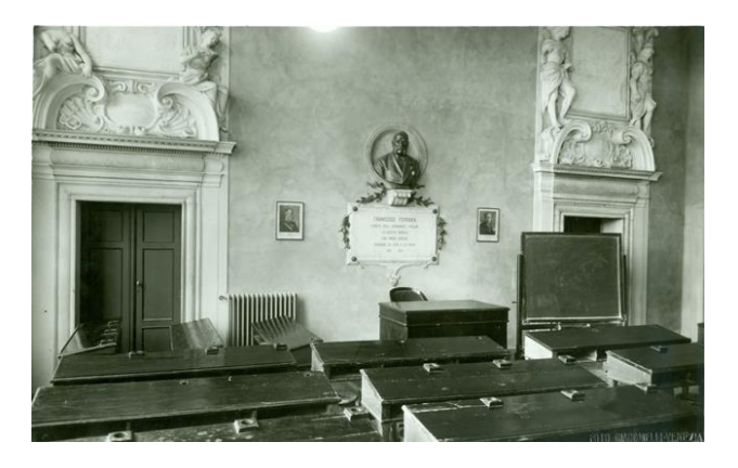
6.Lecture Room, 1930/1940

The back of the card has information on the organisation of the courses, the value of degree qualifications, the offer of Japanese and Arabic language courses. The matriculation fee at the time was 60 lire while the annual tuition fee was 120 lire.